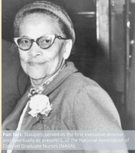
Fun fact: Staupers served as the first executive director, and eventually as president, of the National Association of Colored Graduate Nurses (NAGN).